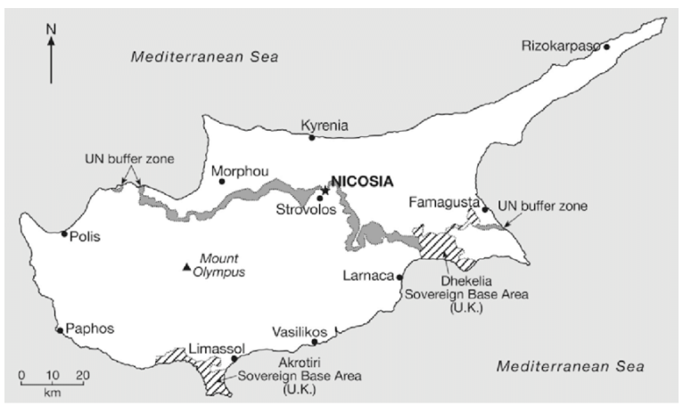
Figure 1 Map of Cyprus showing main cities and the north-south divide (Oktay2009)

Due to its geographical location and strategic importance, Cyprus was the focus of interest of various cultures and people. The island has been under the control of many different powers. In this respect, multicultural identity is one of the most important aspects in the traditional houses of the walled city of Nicosia. (Gunce, Misirlisoy, 2019) The City of is one of the oldest settlements on the island. The walls that surround the city consist of eleven towers. After the year 1974, the city of Nicosia was split in half, forming a Turkish and Greek separation within an area called Arabahmet, which currently forms the south / south-west borders of each side. From that date onwards, this area lost its permanence and could only relate to Turkish side. The houses that we question are the ones located within the Arabahmet area in the north whereas the ones in the south are just behind the same spot in Ledra area. The far end of Ledra area leads into the Lokmaci checkpoint that gives access to the Turkish side. Hence, the houses in the Arabahmet area and the ones constructed upon Ledra Street are physically very close to each other and are all good examples of the traditional Cypriot way of living.